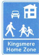
Entrance to a Home Zone

Home Zones are residential areas with streets designed to be places for people as well as for motor traffic. The road space is shared among drivers and other road users. People could be using