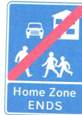
End of Home Zone

the whole of the space for a range of activities. You should drive slowly and carefully and be prepared to stop to allow people extra time to make room for you to pass them in safety.