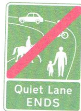
End of Quiet Lane